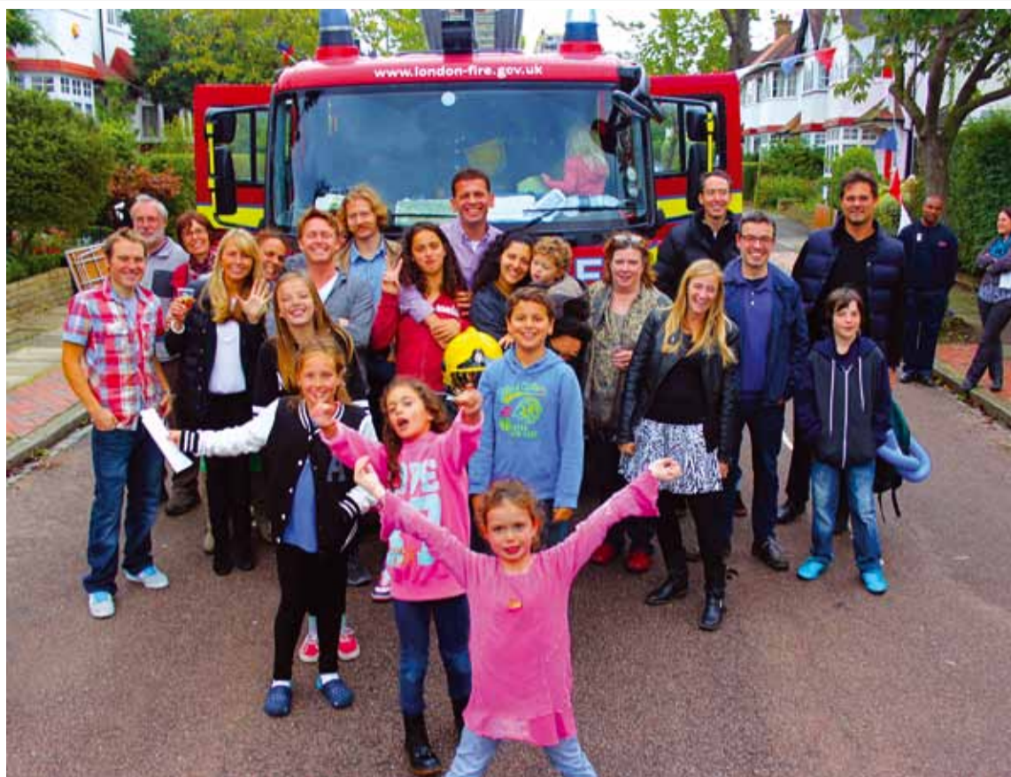
Fun with the firemen.

If you have any information about any of these burglaries, please call the police on 101. If you want to remain anonymous, please call Crimestoppers on 0800 555111.