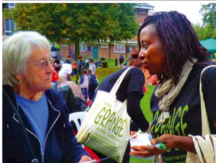
Organisers were keen to get the views of adults.

A fire engine made a good-will call which delighted the kids, and even had a couple of the older ladies eyeing up the firemen. Thank you, Sara, for turning a disaster into a celebration.