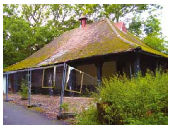
A blot on the landscape?

In August 2012 The Arch-ER's front page featured Barnet's intention to grant a 25-year lease on the pavilion, which has become increasingly dilapidated over the last 30 years. It is sited on Metropolitan Open land so is subject to planning restrictions