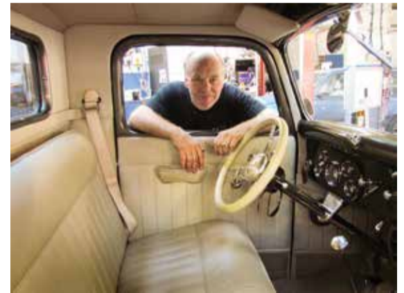
After: How it will look after five years of hard work.