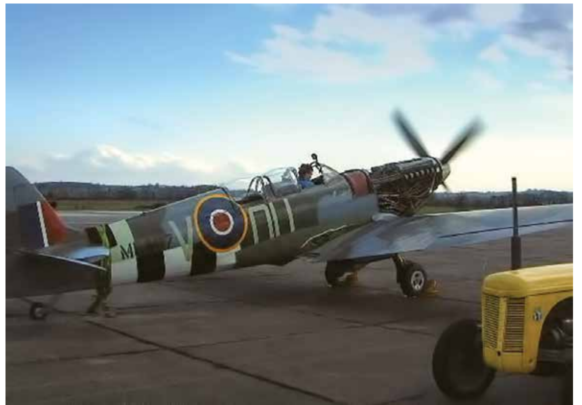
The Grace Spitfire

As soon as the formalities are completed, Mobilise will have the authority, as trustee, to review the constitution and then operate the centre. "At that point, they will be able to work with residents to establish how the Old Barn can be used for the benefit of the community," said a spokesperson from Barnet Council.