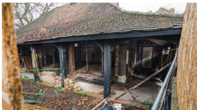
The Cherry Tree Wood pavilion March 2015.

Upset by the present state of the building, readers have been asking what is happening to the pavilion in Cherry Tree Wood.