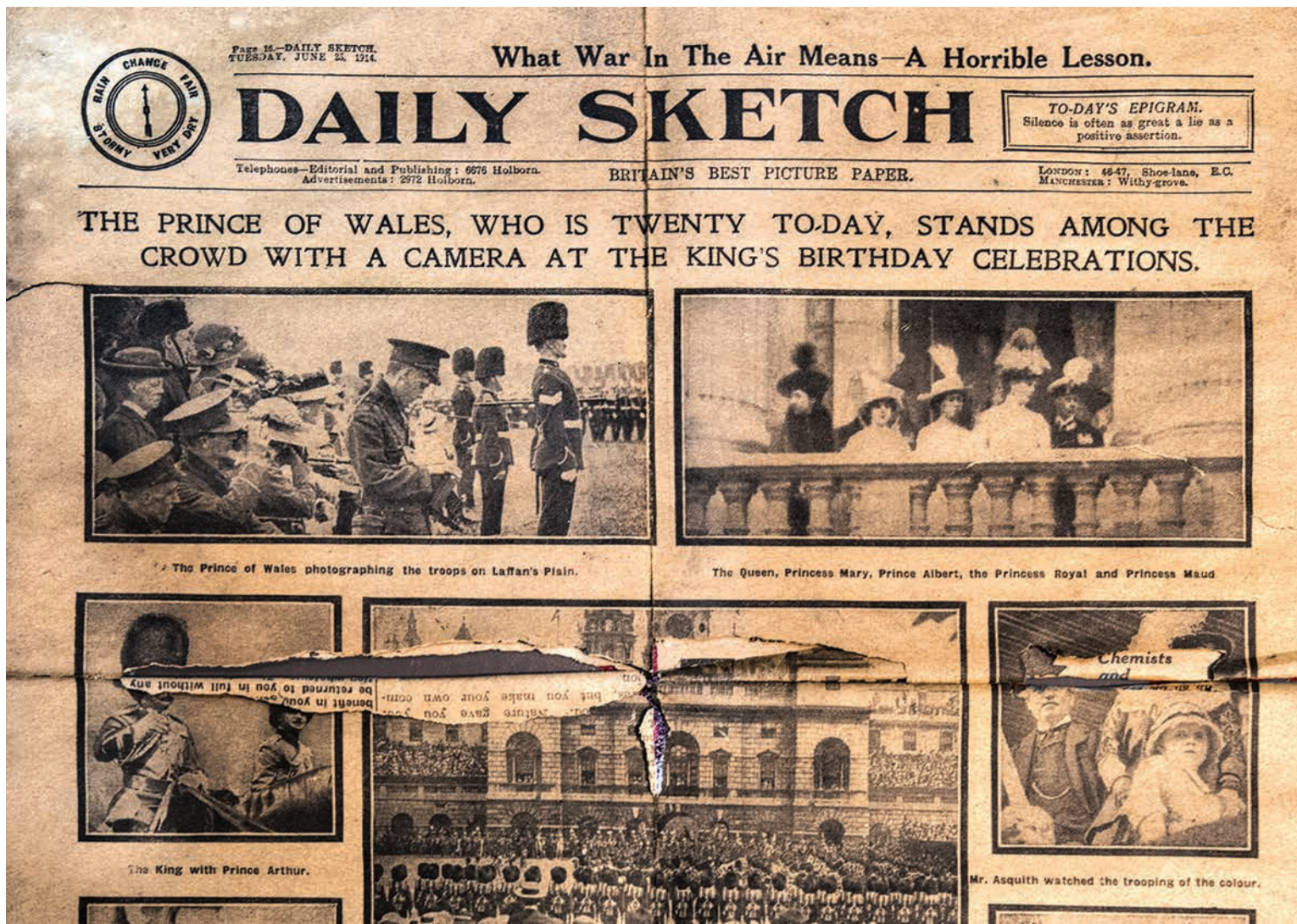
A detail of the 100 year old copy of the Daily Sketch found when The Exchange was being renovated.

Published by East Finchley Newspapers, P.O. Box 3699, London N2 8JA. www.the-archer.co.uk