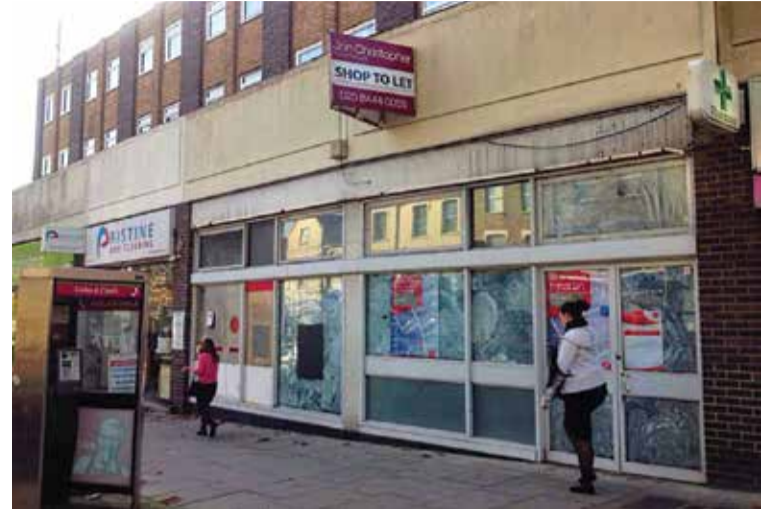
What's next? The Post Office building in the High Road still has a 'To Let' sign up.