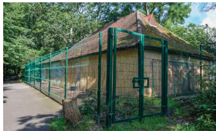
The current state of the Cherry Tree Wood pavilion.

What do you think should happen to the pavilion and how could the park be improved? Let THE ARCHER know. Our contact details are above.