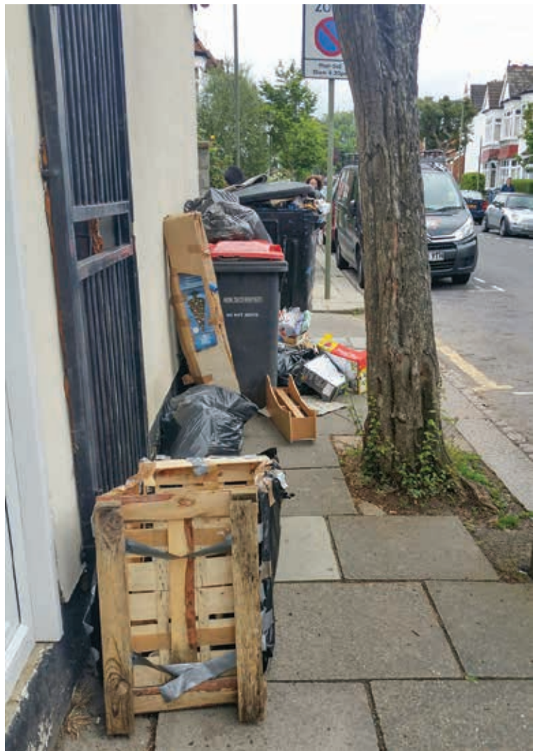
Pile-up: Rubbish in Baronsmere Road