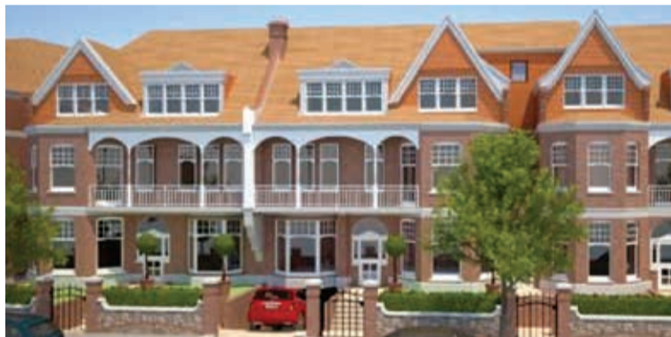
New look? Plans are afoot to turn the Raglan Hotel into flats

director of property company Safeland who bought the three-star hotel 18 months ago, told the Ham & High newspaper last month that the 50-bed Raglan had been unviable for many years and was falling into a state of disrepair.