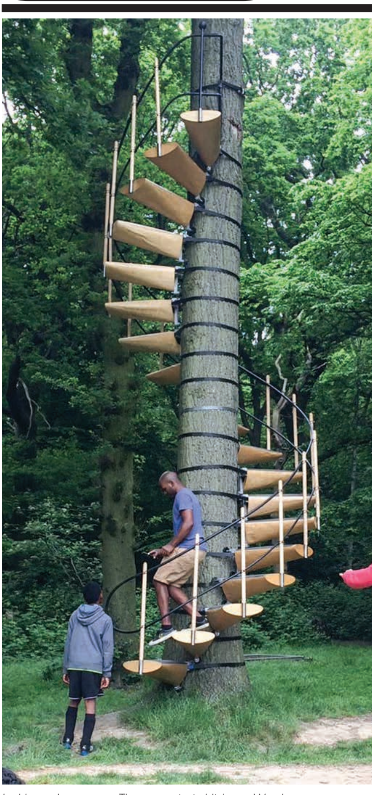
Ladder to the treetops: The tree stairs in Highgate Wood.