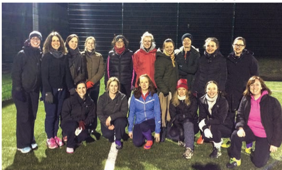
Team talk: The women's football team at Stanley Road

Are you keen to get out in the fresh air, get fit, have a laugh, make new friends and learn new skills, such as back-heeling a ball, kicking with laces, and taking 'proper' throw-ins?