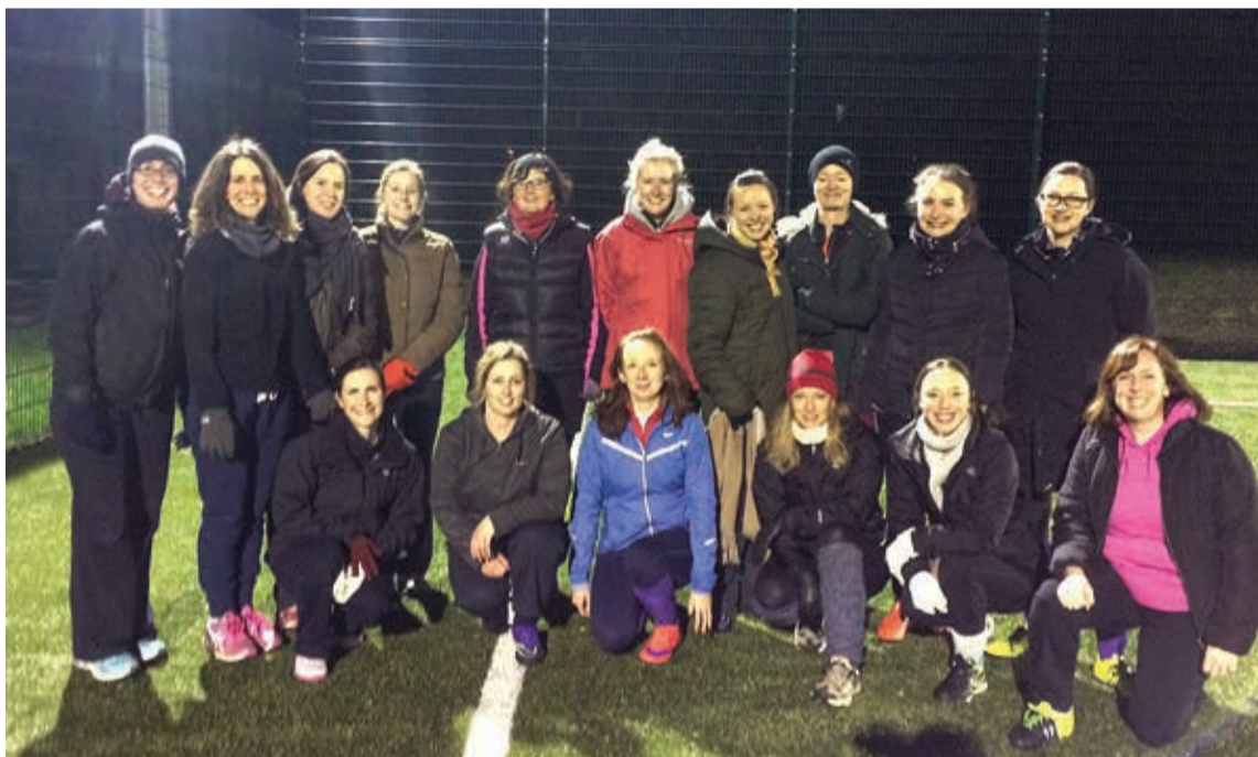
Team talk: The women's football team at Stanley Road

Are you keen to get out in the fresh air, get fit, have a laugh, make new friends and learn new skills, such as back-heeling a ball, kicking with laces, and taking 'proper' throw-ins?