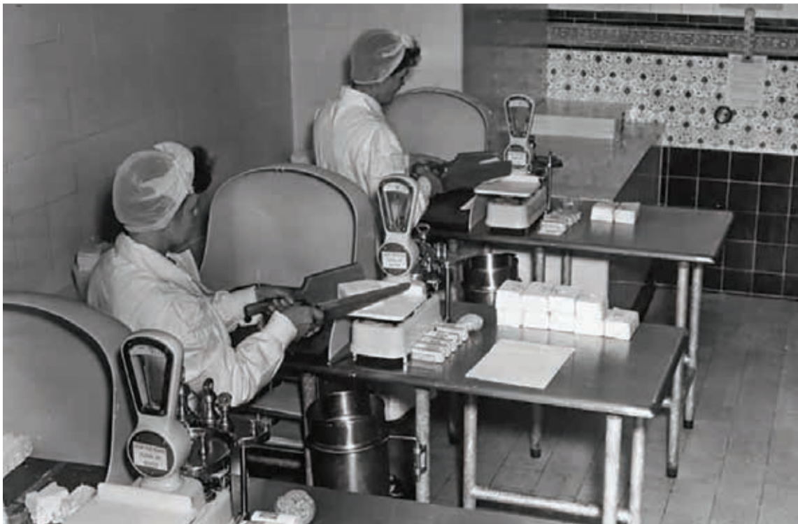
Personal service: Butter measuring at the East Finchley branch of Sainsbury's in 1954.

Published by East Finchley Newspapers, P.O. Box 3699, London N2 8JA. www.the-archer.co.uk