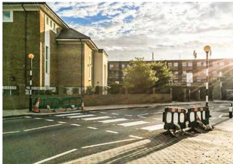
The zebra crossing in East End Road.

The crossing was eventually finished when a second team of workmen levelled the earth around the beacons and the barriers were removed. With no official opening date residents in the area have already started using it and are not expecting Her Majesty to arrive with scissors anytime soon.