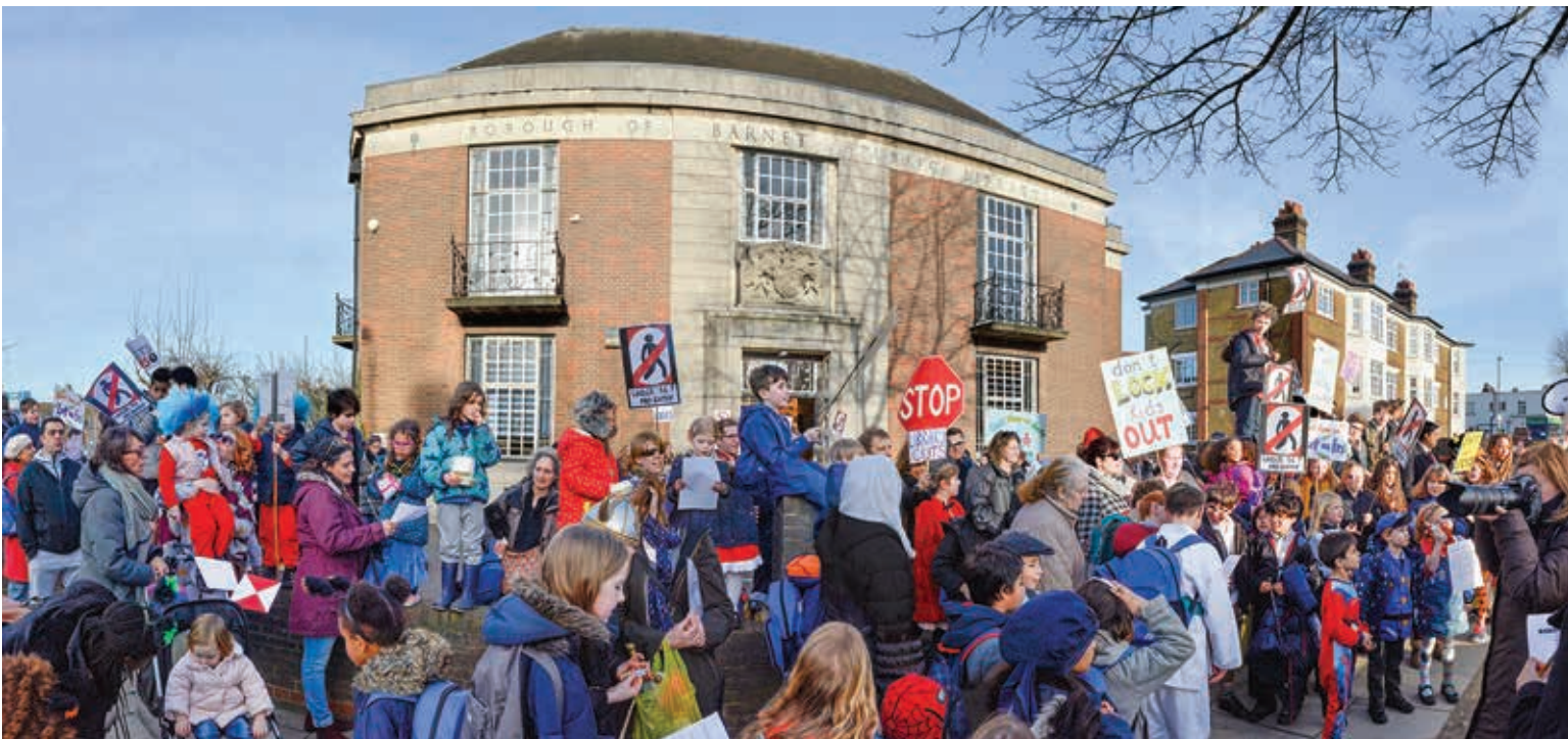
National Book Day protests against library closures in East Finchley.

A community newspaper for East Finchley run entirely by volunteers.