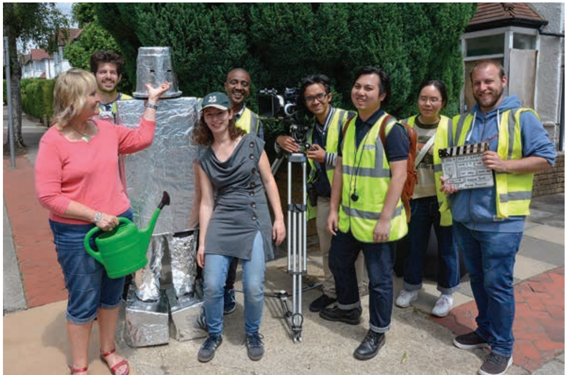
It's a wrap: The London Film School crew in Summerlee Avenue.

Other changes include the introduction of a 'motorcycle business permit' available to businesses situated in the East Finchley controlled parking zone, at a cost of £525 for a set of four permits, as well as an extension of the motorcycle parking place outside numbers 87 and 89 High Road. Permits will be electronic and no paper permits will be issued. Peter hopes that these changes will make it easier for drivers to find an empty parking space.