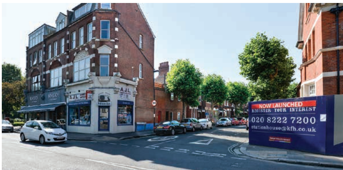
The proposed site of the Car Club parking in Fortis Green Avenue.

www.fionahurlock.com Utopia, N2 9EJ Ph 07795 203107