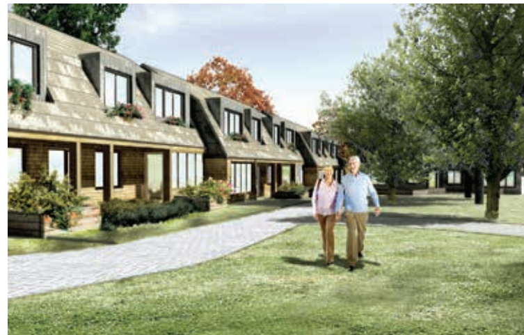
This is an illustration of how the new Finchley Charities development (Octavia House) should look.

Mindfulness Meditation classes run by East Finchley Altogether Better have been postponed from their original January start date and will now kick off on 7 February instead. They will run on Tuesday evenings from 7.30pm to 9pm at the Archer Academy, Eagans Place, N2. To book, email: us@efab.org.uk .