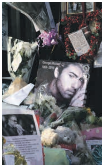
Right: Tributes for George Michael outside his Highgate home.

His friend Sir Elton John called him "the kindest, most generous soul and a brilliant artist" and his death was mourned by fans around the world.