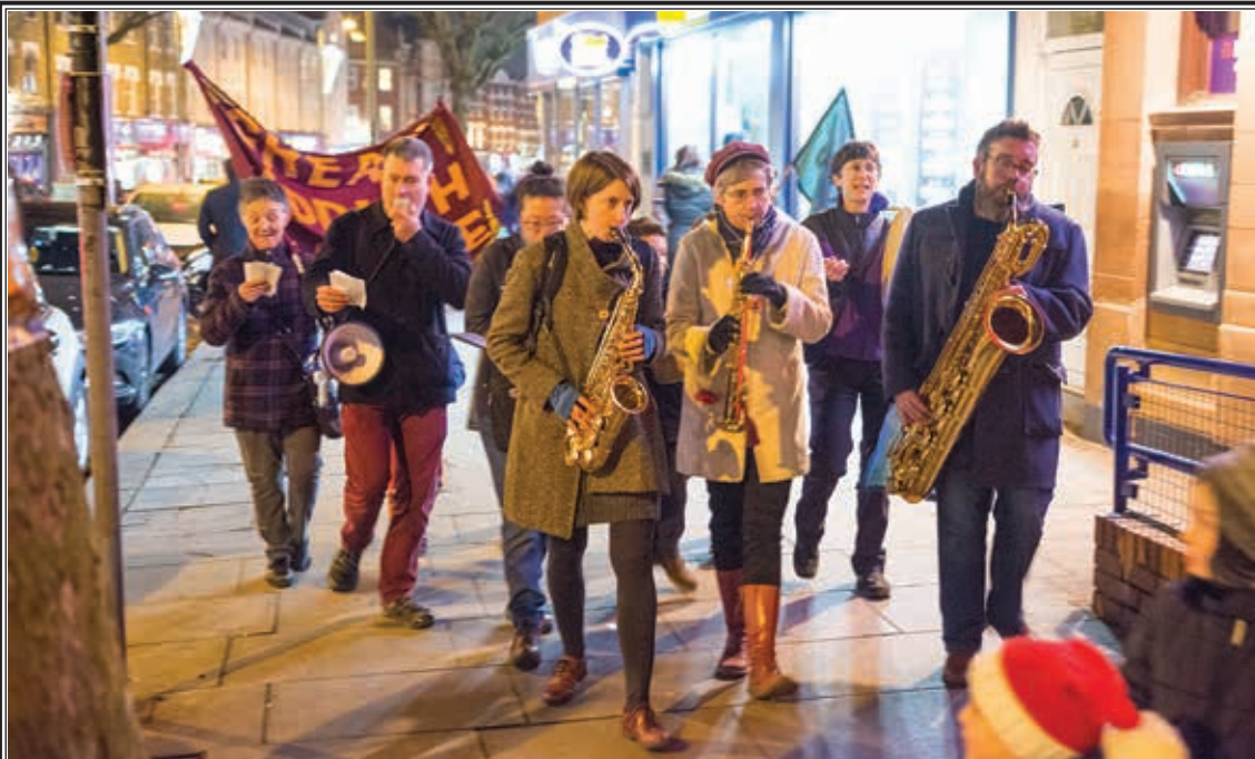
Band on the run: The Yiddish marching band provided a mobile musical experience moving in and out of stores at East Finchley's late night shopping event in December. Turn to page 6 for more photos from the event.

A community newspaper for East Finchley run entirely by volunteers.