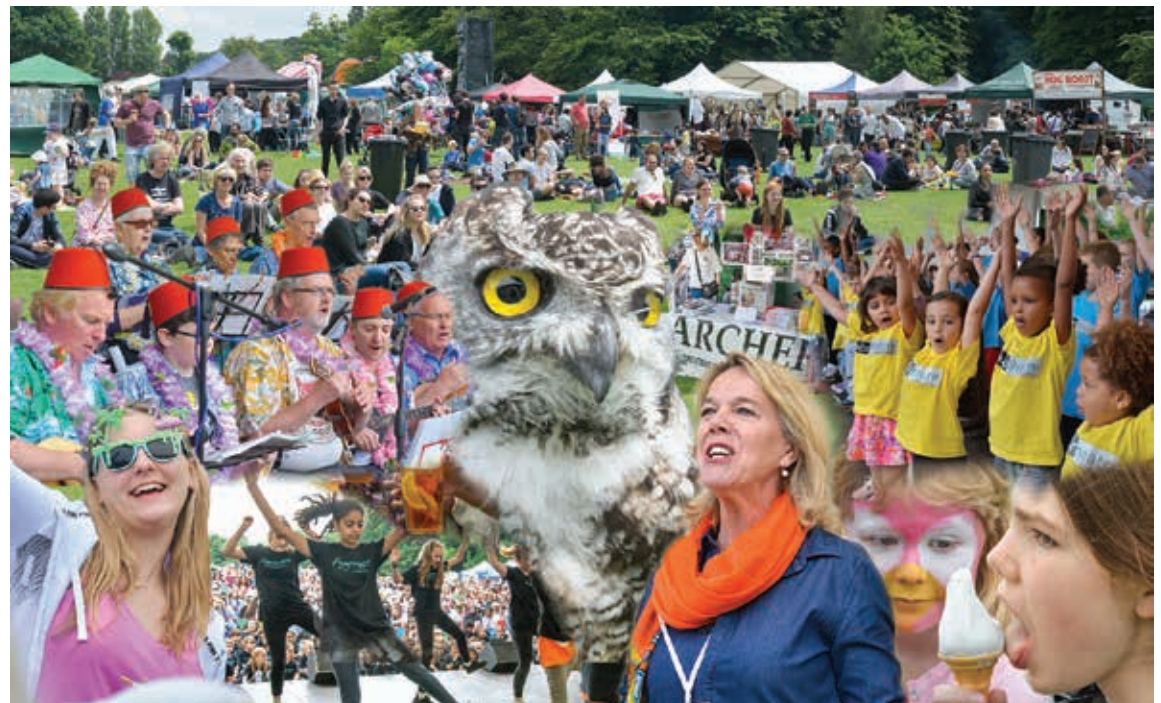
All together now: Faces and fun from last year's summer festival. Photo montage by Mike Coles