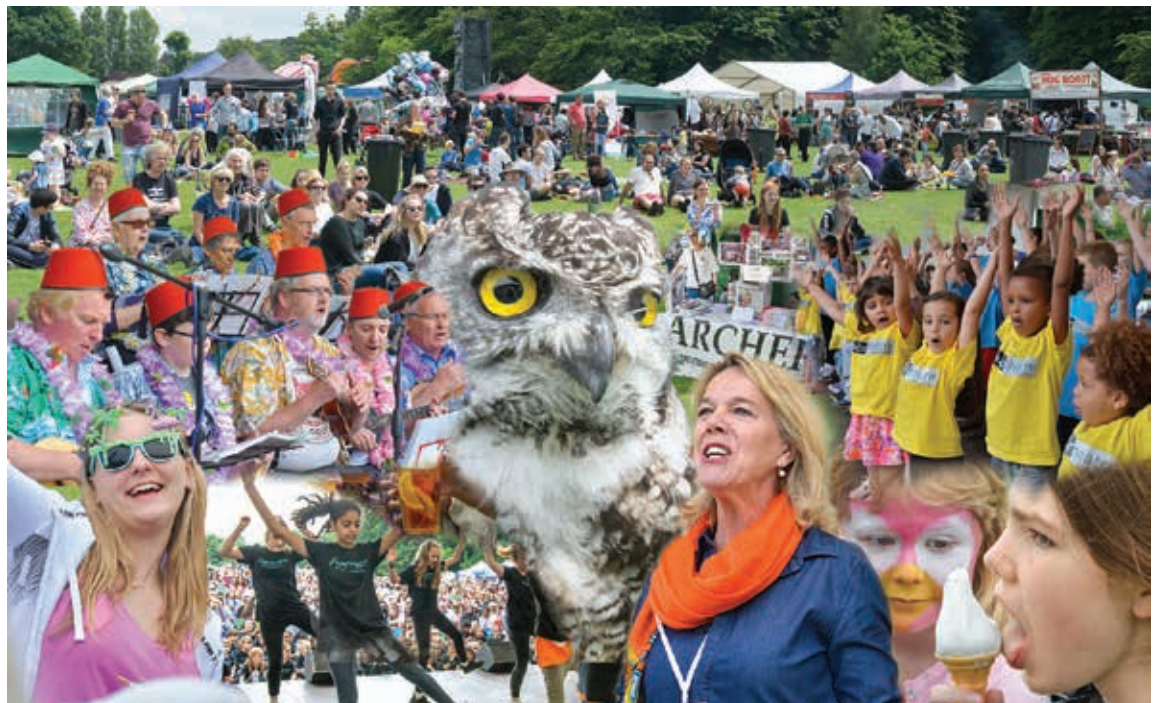
All together now: Faces and fun from last year's summer festival.