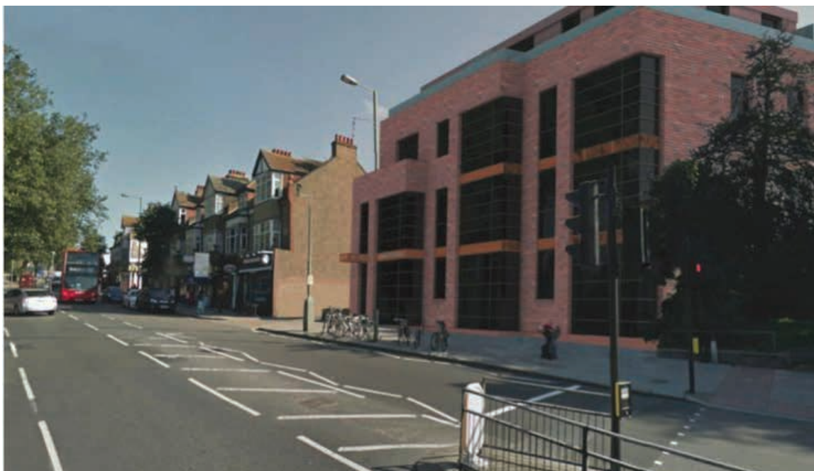
How the proposed building on the site of GLH would look. permission for that?"