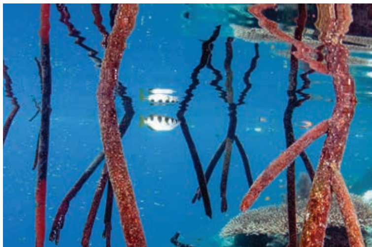
Joss: "I spotted this archer fish and its reflection in the mangroves in Raja Ampat, West Papua, Indonesia. The archer fish swims along just below the surface looking for insects resting on the foliage above the water. It fires a jet of water, dislodging the insect, which then becomes prey. It is always difficult to get close to these fish but the calm waters in the shallows of the mangroves offer great opportunities for reflections."