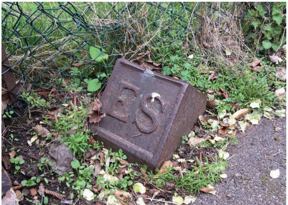
Mystery object: The metal plinth in Pumphandle Path.

On that website, you can also report crime and anti-social behaviour, apply or register for things like charity collection licences, request vital information, such as collision reports, and read the latest crime prevention advice.