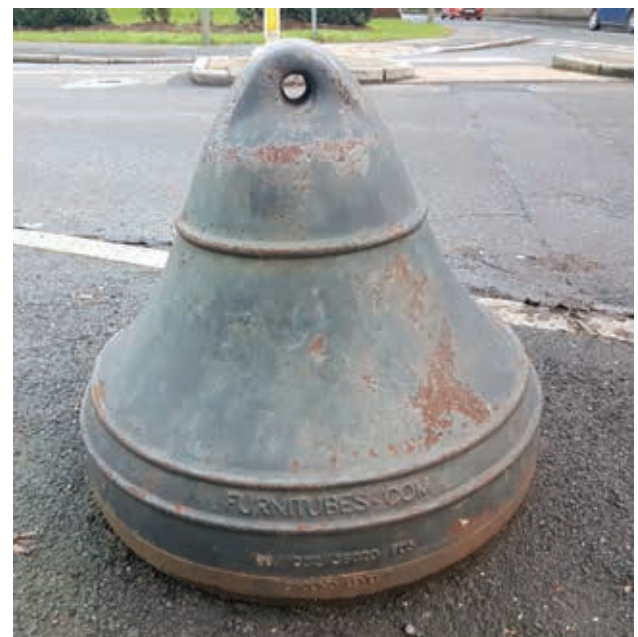
Bulbous: The bollard

Have you seen an object around East Finchley that you are curious about? Send us a letter and a photo if possible to The Archer , PO Box 3699, London N2 2DE or email the-archer@lineone.net , and we'll see if readers can help shed light on it.