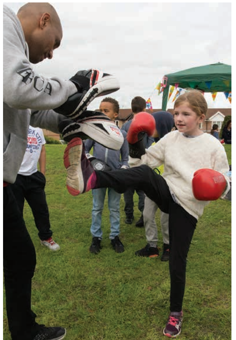
High-kicker: A Fun Palace visitor tries martial arts with help from the East Finchley Combat Academy.

The scooter owner was treated at the scene by the London Ambulance Service and taken to hospital with a fractured toe. If anyone has any information please call 101 or contact Crimestoppers anonymously on 0800 555111.