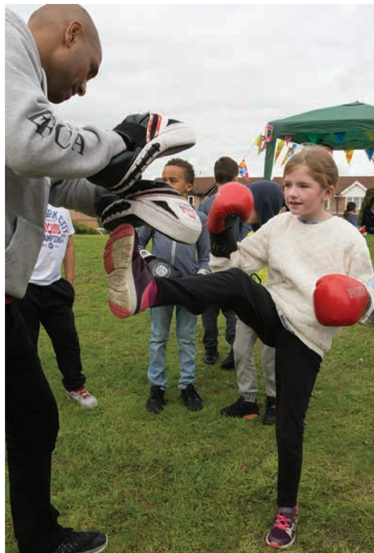
High-kicker: A Fun Palace visitor tries martial arts with help from the East Finchley Combat Academy.

The scooter owner was treated at the scene by the London Ambulance Service and taken to hospital with a fractured toe. If anyone has any information please call 101 or contact Crimestoppers anonymously on 0800 555111.