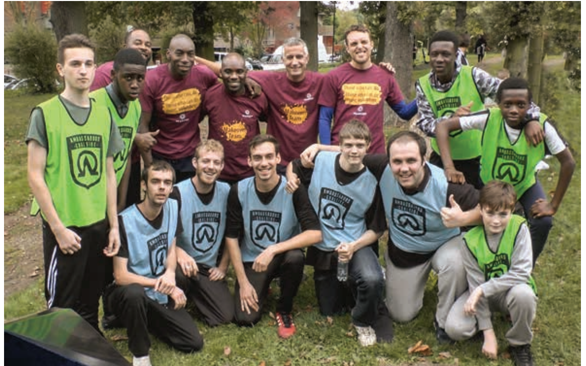
Friendly rivalry: The Peabody Trust and residents' football teams faced each other at the fun day.

The story is not all one sided, however, as two residents told The Archer that they approved of the new surface and that it would be safer, particularly for the visually impaired. One Huntingdon Road resident added that he thought it would be easy on the eye, commenting that he would rather see money spent on street cleansing than on expensive paving.