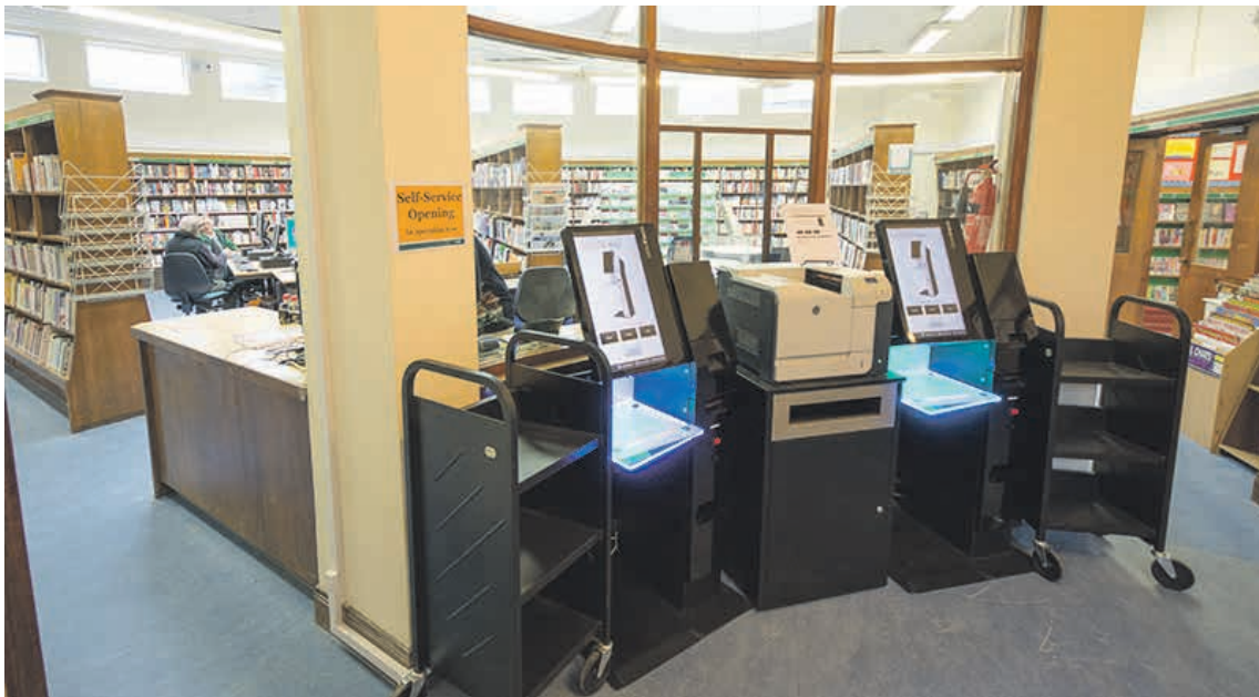
Self-service: The book lending machines in the library foyer

The Government is currently looking at whether Barnet Council is fulfilling its legal duty to supply a comprehensive library service and there is still time to make your voice heard.