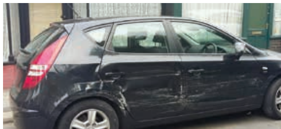
Crunched: The damage to Sarah Higgison's parked car after another vehicle collided with it on the way down Church Lane.

Six days later another car driver lost control at the same spot at 3pm, smashing into another parked vehicle. This time the car could not be driven off since it was badly damaged but the driver did run from the scene.