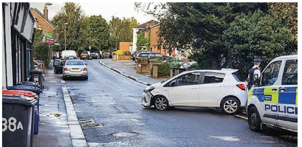
Aftermath: A car lies across Church Lane after failing to negotiate the bend in early September.

Six days later another car driver lost control at the same spot at 3pm, smashing into another parked vehicle. This time the car could not be driven off since it was badly damaged but the driver did run from the scene.