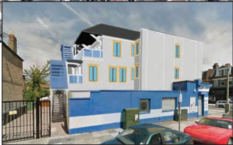
The proposed redevelopment of 127 - 133 High Rd viewed from above and from Kitchener Road