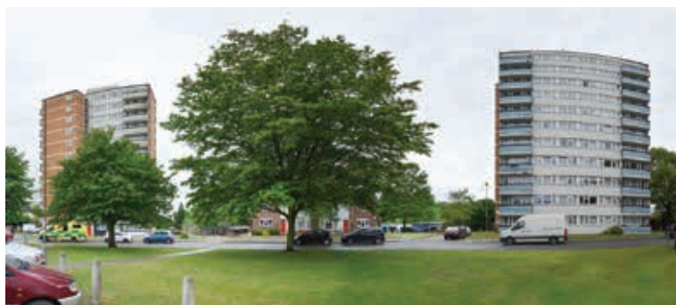
Two blocks: Prospect Ring as it currently looks.

If you can't make the meeting but still want to let organisers know what you think could be improved or want to offer your help nearer the time then send an email to: festival@myEast-Finchley.org.uk.