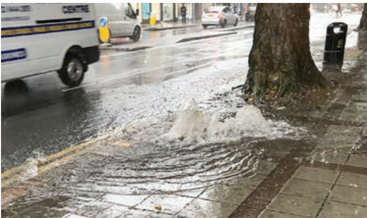
Overflow: This storm drain couldn't cope with the British summer.

Wesam from Syria's written comment summed it up: "I'm very happy here. I wouldn't want to move. There is good harmony here, a lovely place to live."