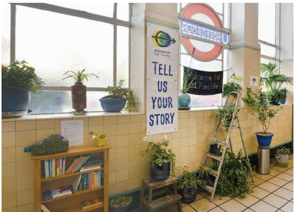
'Home from home': East Finchley tube station.

Water cascaded down the hill towards the tube station, forcing oncoming traffic to take evasive action. Affinity Water sent along a technician to inspect the drain and found the sheer volume of water had caused the burst. Thanks to Roger Beeson, who tweeted the photo.