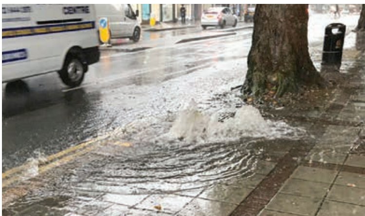
Overflow: This storm drain couldn't cope with the British summer.

You can reduce the risk of your two-wheeler being stolen by locking it securely to a fitted anchor and by installing audible alarms. Meanwhile phone users should stay alert at all times and avoid texting while walking. Find your IMEI number by dialling *#06# from your phone and keep a written note of it. If the phone is stolen, report it to the police and your mobile provider to stop it being used.