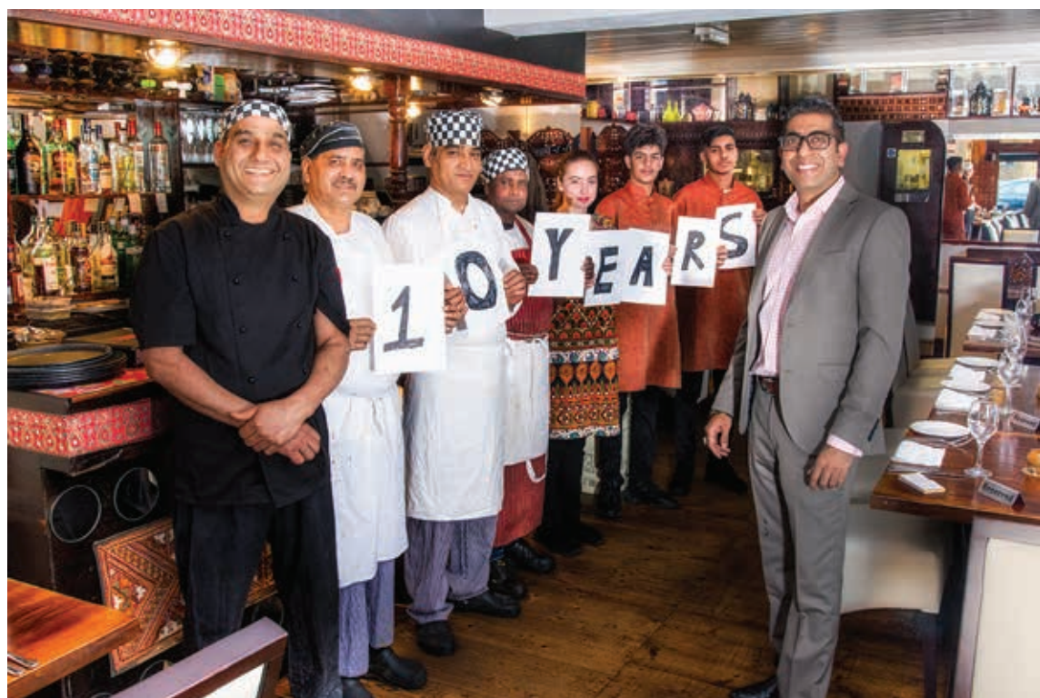
Celebrating 10 years at the Indian Rasoi on Fortis Green.