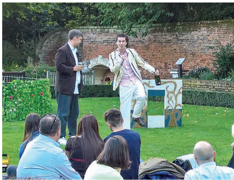
The Shooting Stars Theatre Company production of Twelfth Night on the lawn at Lauderdale House.