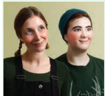
Pop up Opera (15 Oct)

children from Martin Primary School, a screening of the classic dark comedy The Ladykillers at the Phoenix Cinema and a chance to join the singing yourself in a performance of Fauré's Requiem .