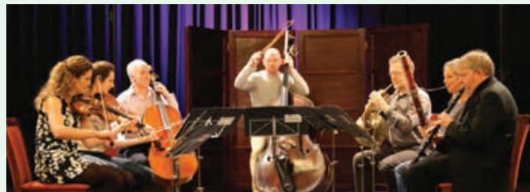
London Mozart Players Chamber Ensemble (10 Oct)

The East Finchley Arts Festival supports Noah's Ark Children's Hospice and the Harington Scheme for young people with learning difficulties. Here's the full programme: