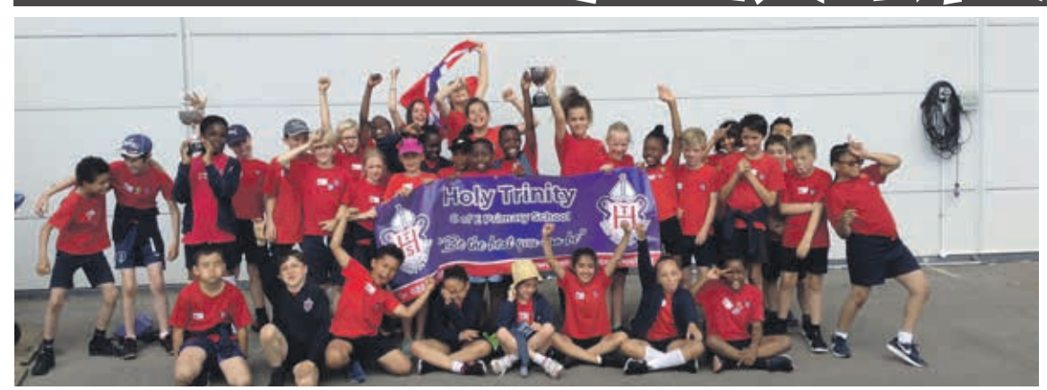
Team triumph: The victorious Holy Trinity pupils at the Allianz Stadium.