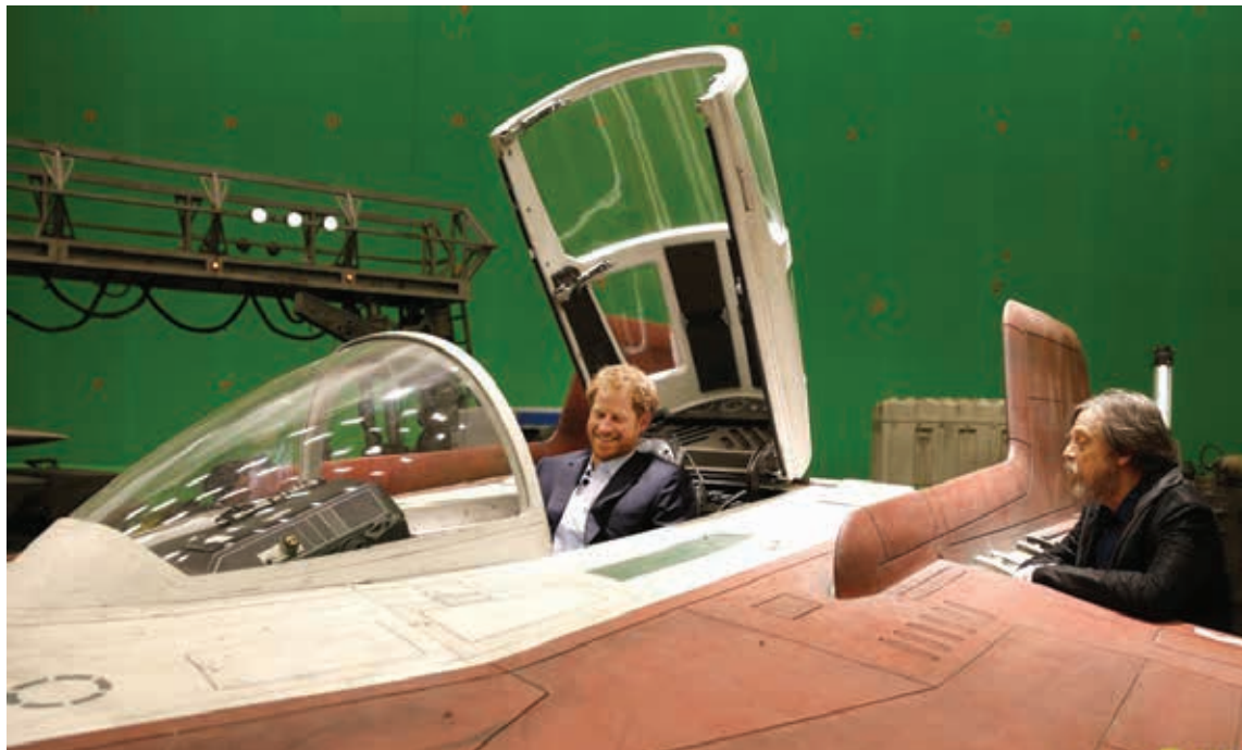
Screen prince: Prince Harry laughs with actor Mark Hamill as he sits under a Talbot's plastic canopy made for a fighter craft in Star Wars: The Last Jedi .

Behind the company's unassuming entrance in Long Lane are workshops, specialised machinery and huge ovens