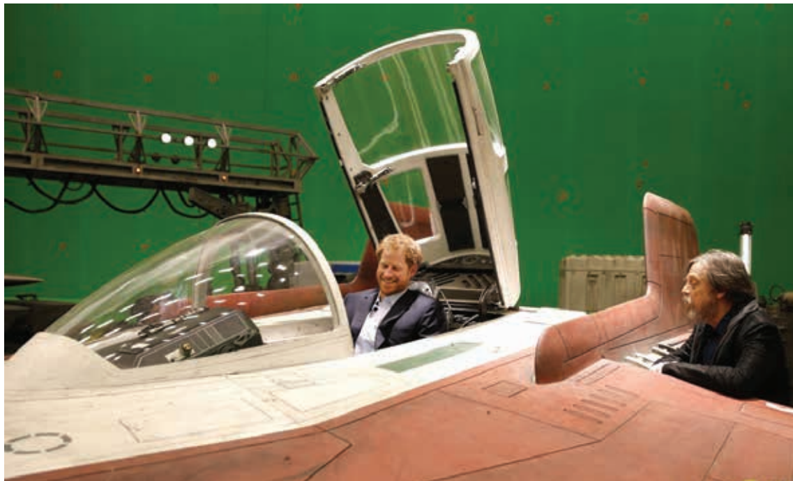
Screen prince: Prince Harry laughs with actor Mark Hamill as he sits under a Talbot's plastic canopy made for a fighter craft in Star Wars: The Last Jedi .

Behind the company's unassuming entrance in Long Lane are workshops, specialised machinery and huge ovens