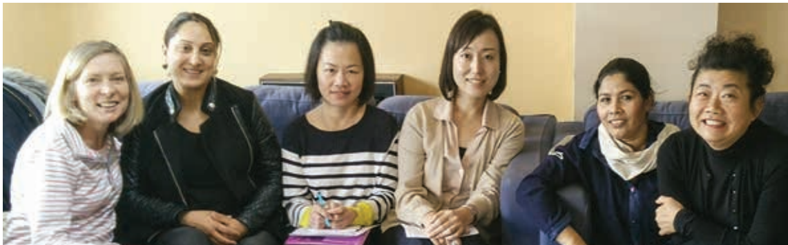
New friends: Learners try out their English together at East Finchley Baptist Church.