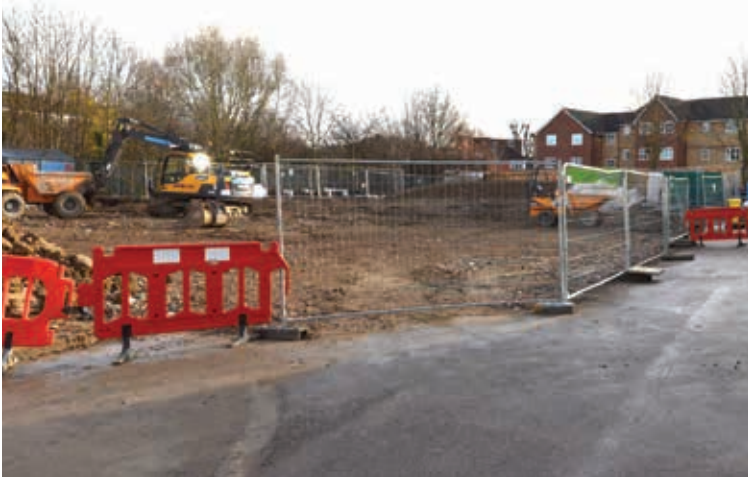
Clear ground: The Tarling Road building site earlier this year