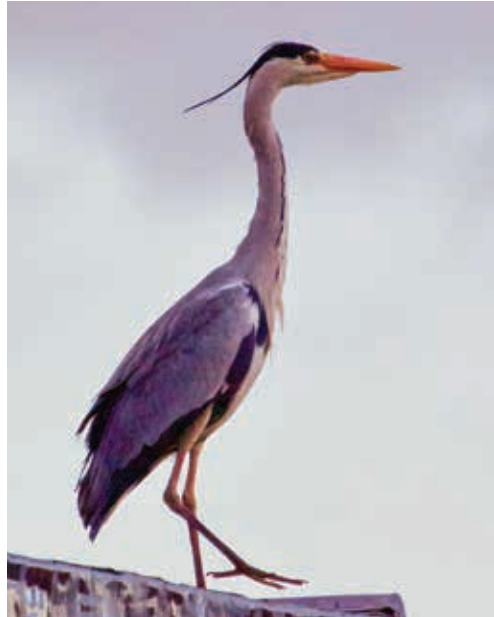
Chris's photo highlights the heron's elegant form.