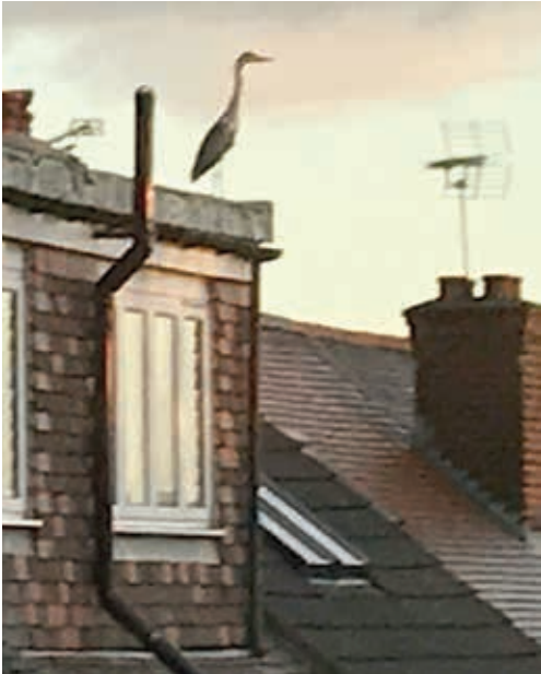
The heron perches on the Fortis Green roof.