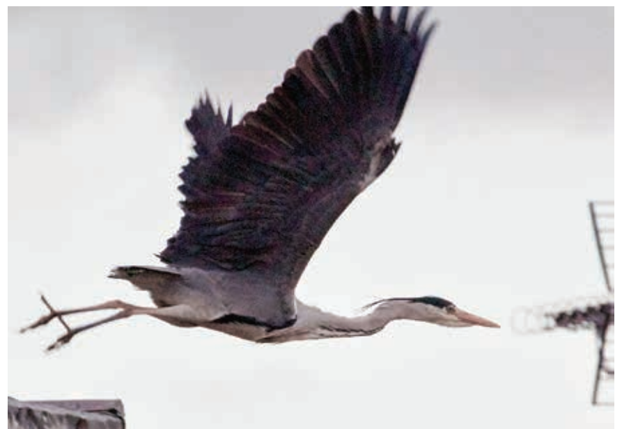
On the wing: The heron flies off among the rooftop aerials.