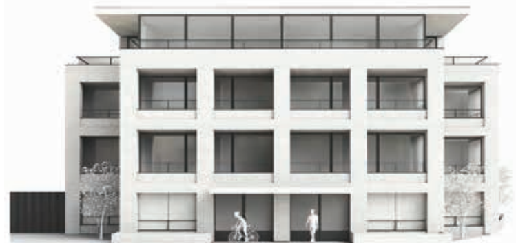
New homes: How the flats would look from the High Road.

Secretary of State James Brokenshire MP allowed the appeal as he considered the buildings would not, in fact, be