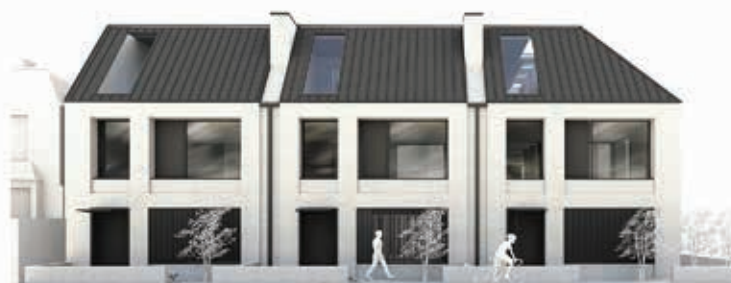
Terraced: The three proposed houses on Leopold Road.

over-dominant or out of place. The terraced houses will chime with existing Leopold Road houses, and the block of flats will blend with the mix of other buildings on the High Road.