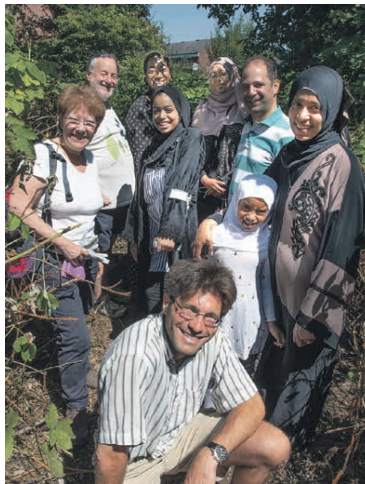
Wild wood: Volunteers help with clearing.

The volunteers' picnic included food and information on the nearby Brownswell Green. It was organised by