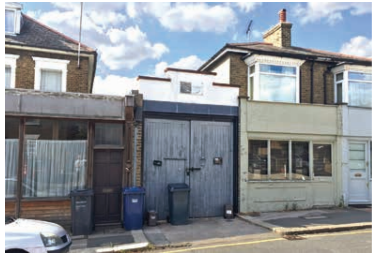
Tight fit: The development site, centre, currently fronted by gates, is in the gap between existing properties.

Developers have already applied twice for permission to build on the site but were turned down by Barnet Council on the grounds that it would be too cramped. Planning officials also ruled it would be out of keeping with nearby houses such as numbers 28, 30 and 32 which are listed as being of local architectural and historic interest. Two appeals have been refused.