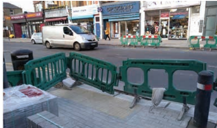
Under construction: Work underway on the new crossing

The fatal collision came after our front page article in last month's edition reporting on calls by staff and parents to improve safety at the pedestrian crossing on the High Road outside Martin Primary School.