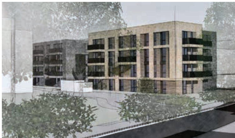
First impression: Artist's drawing of the proposed development.

Key points for discussion were the residential context for this current 'brownfield' site, once a petrol station, close to the Indian Rasoi restaurant and opposite Eastern Road; the mixture of affordable housing and 'market' housing, 50 homes in all, in the two blocks; and the landscaping of communal and