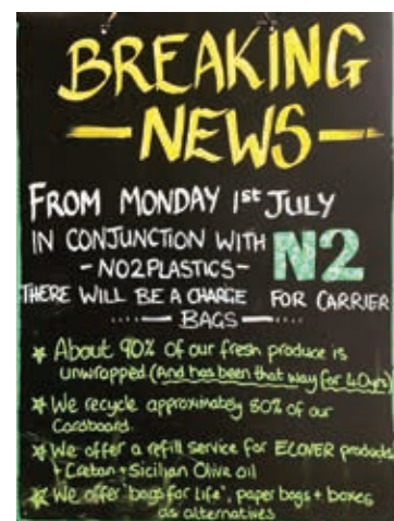
Carrier charge: The sign at Tony's Continental discouraging the use of single-use plastic bags and encouraging other forms of recycling.

No2Plastics is working alongside Tony's to change current shopping habits in East Finchley. Won't you join us? Find us on Facebook and Instagram: @No2PlasticsN2.