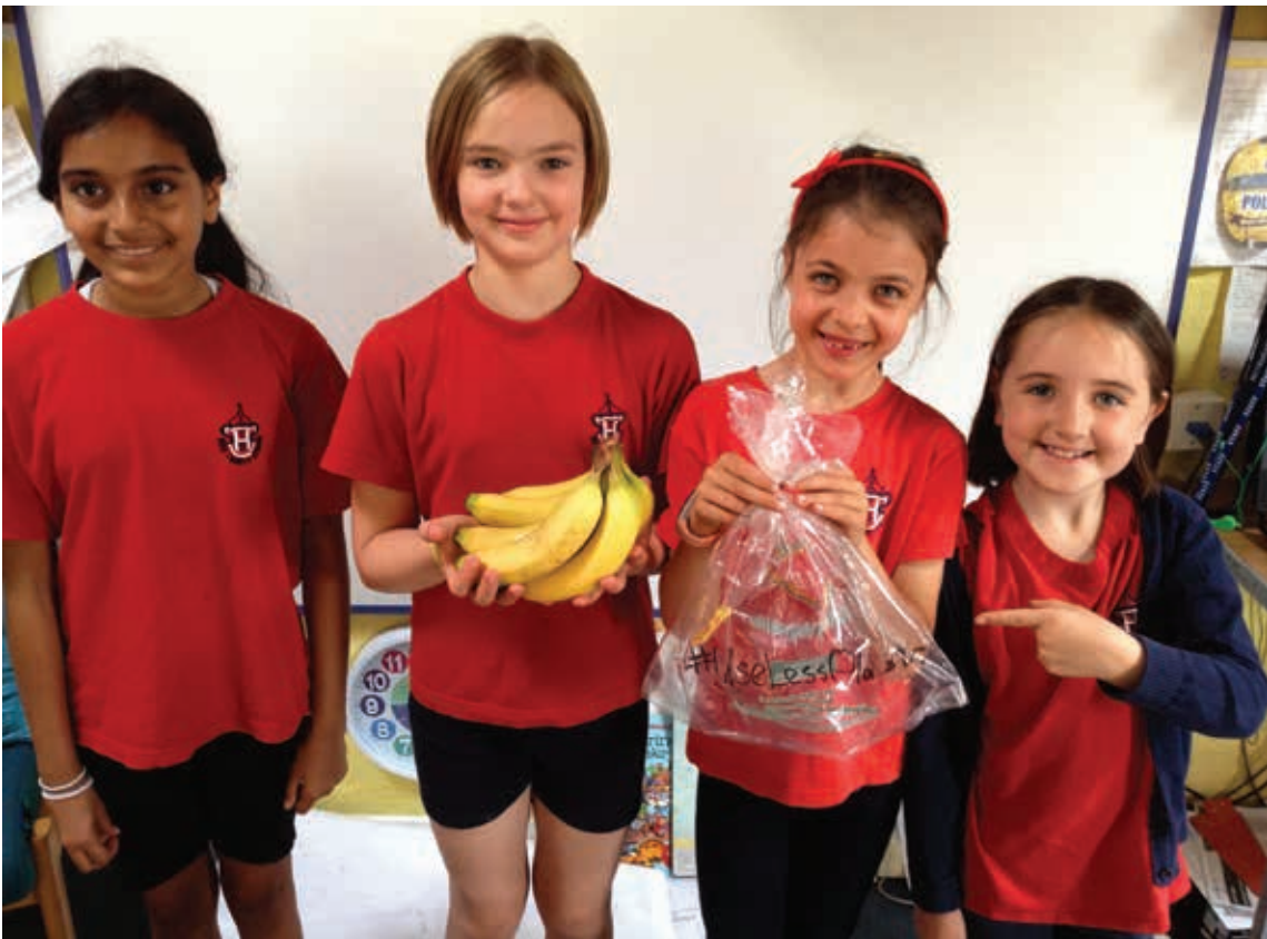
Just bananas! Holy Trinity pupils ask why fruit has to be wrapped in plastic.