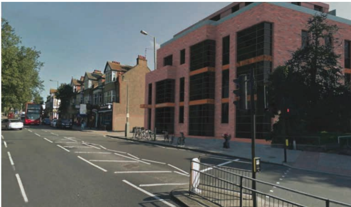
Expanded development: An early artist's impression of how the new block will look.

A plan to increase the number of flats at a controversial development opposite East Finchley tube station, first reported in The Archer in July, has been approved by Barnet Council.