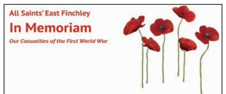
Tales to remember: The cover of one of the All Saints' books