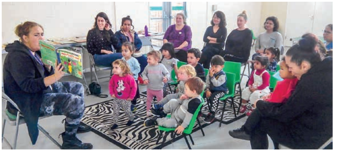
Story time: Children enjoying a picture book at the Finchley Community Toy Library.

These long-serving milkmen have at least succeeded in protecting their rounds for now, so customers' deliveries are safe and these traditional, much-valued small businesses won't disappear ... here, at least. In fact there's been a tsunami of support on social media. One typical comment is: "Let's all try to spread the word and help milk delivery services survive."