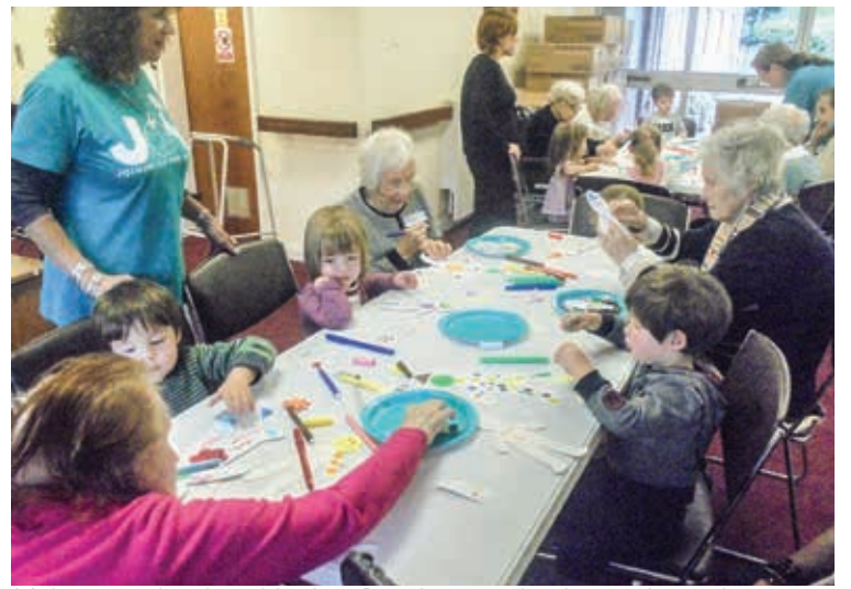
Helping each other: Monkey Puzzle pre-schoolers with residents at Nazareth House.