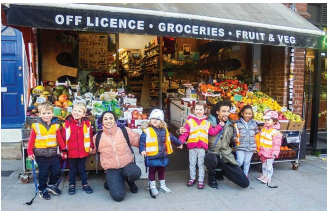
Five-a-day: The Monkey Puzzle children and their carers shop at the N2 Food Centre in the High Road.

A community newspaper for East Finchley run entirely by volunteers.