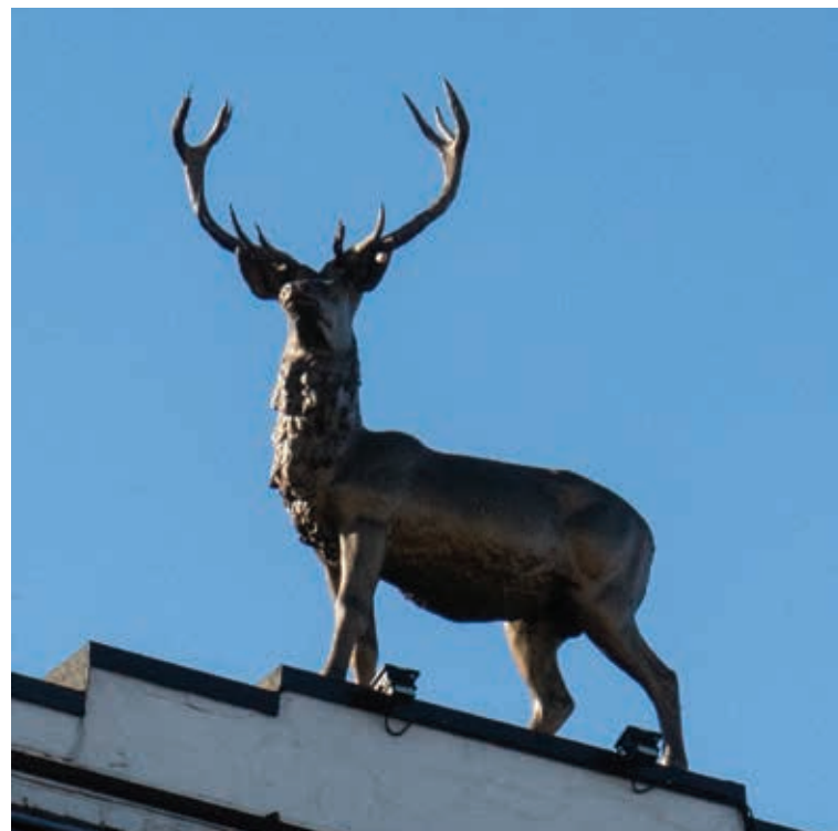
3: The Stag at the Bald Faced Stag pub at the junction of the High Road and East End Road. This proud beast has been there as long as anyone can remember. The pub has changed hands many times over the years but the stag has remained standing proud over the rooftops

A Local Handyman available for general household & garden maintenance. No Job Too Small Free Estimates Call John on: 0789 010 3831 or: 0208 883 5325