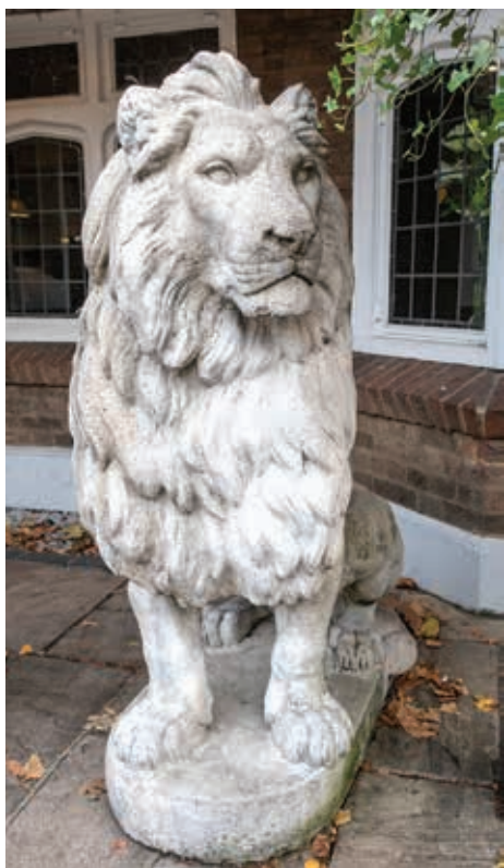
5: The White Lion (or lions, since there are a matching pair). These are at the entrance to the Old White Lion pub next to the tube station. There has been a pub on that site for hundreds of years and its pair of big cats stand ready to welcome drinkers every day of the year.