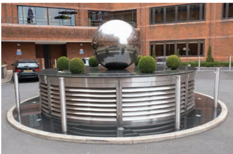
4: The steel globe at McDonalds. This is in front of the main entrance to the McDonalds headquarters (next to the tube station) and incorporates a fountain continually running over the globe, no doubt somehow representing perfection in the hamburger experience.