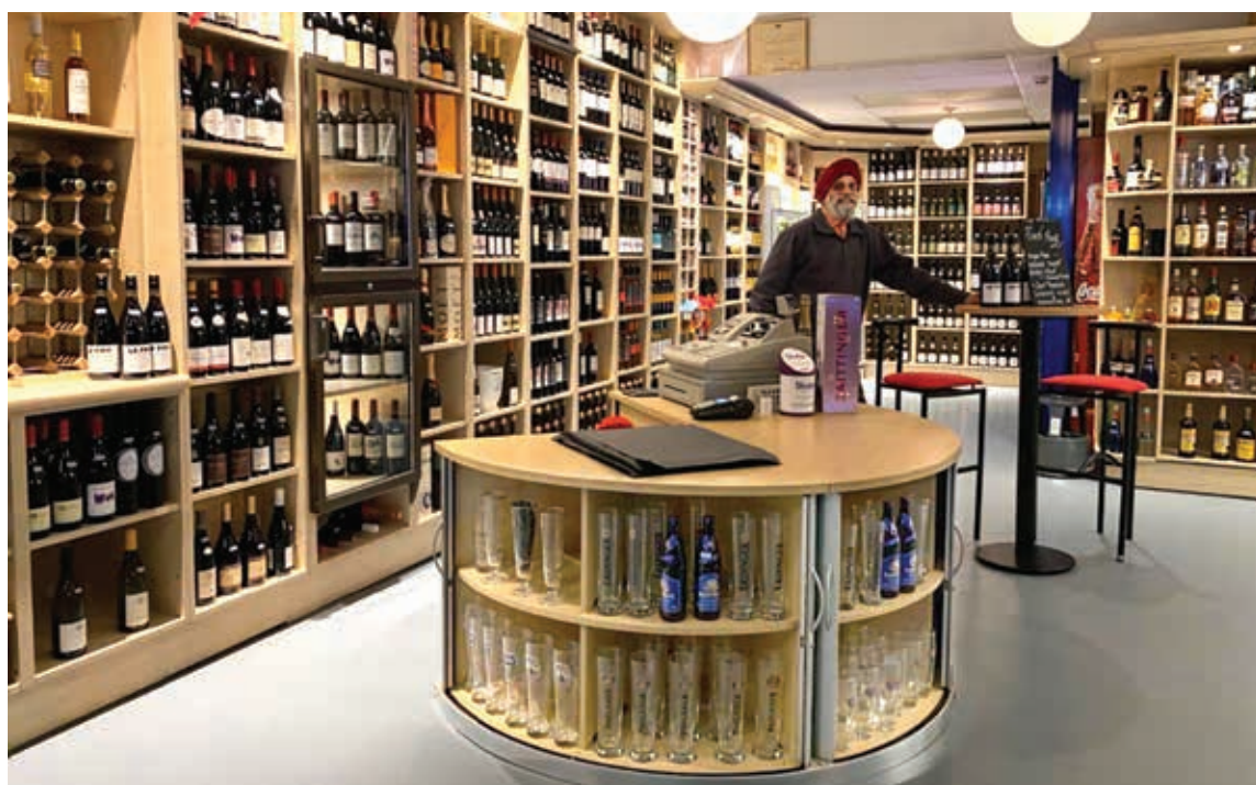
Best cellar: The new interior of the Finchley Wine Store

Find out more about the company at www.buzz-technology.co.uk or contact Senake directly on 07958 933248.