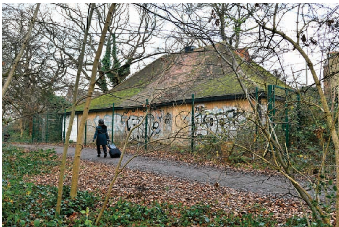
Days are numbered: The derelict pavillion in Cherry Tree Wood.

There have long been differing opinions on what should happen to the structure. Whilst some favoured razing it to the ground and letting nature take its course, others hoped it