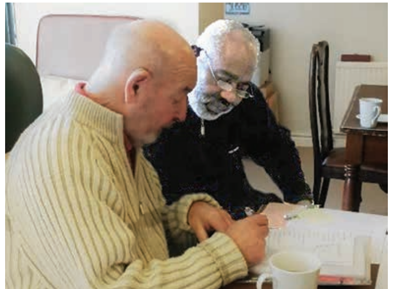
Tick the box: A volunteer helps with form filling

Find out more at www.advocacyinbarnet.org.uk .